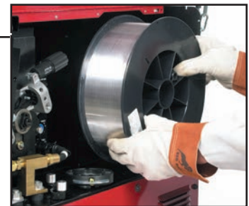
Easy Load Wire Compartment