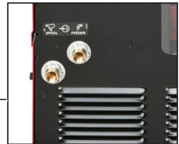
Additional Gas Solenoid – Controls Gas Flow to a Spool Gun