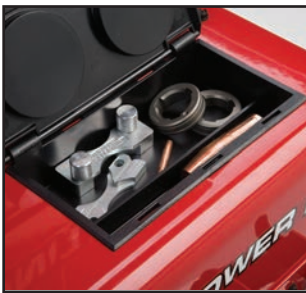
Gun Expendable Parts Compartment