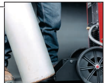
Easy Load Gas Cylinder Platform