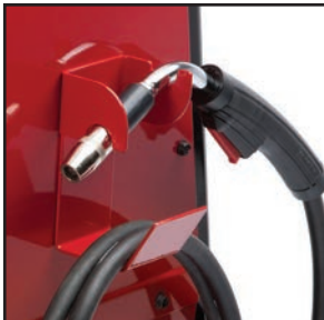
Coil claw Keeps your workstation organized