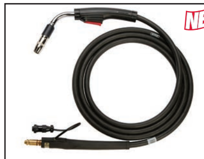
NEW! Magnum® PRO 250L Gun With long lasting Copper Plus™ contact tips

Adds 4-step trigger interlock, spot mode, adjustable run-in speed for smoother arc starting, and adjustable burnback time to minimize wire sticking in puddle.