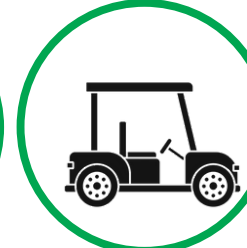
GOLF CARTS (INCLUDES CRICKET)